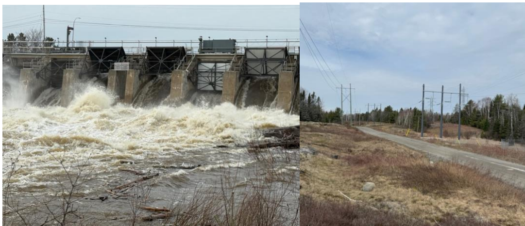
Figure 3. (a) Sturgeon Falls Power Dam and (b) Crystal Falls Power Lines on Property