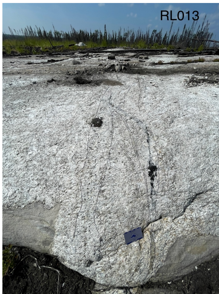
Figure 2. Pegmatite outcrop on Volta’s Root Property containing LCT pathfinder mineral assemblage of garnet, tourmaline, green mica, yellow beryl and muscovite.