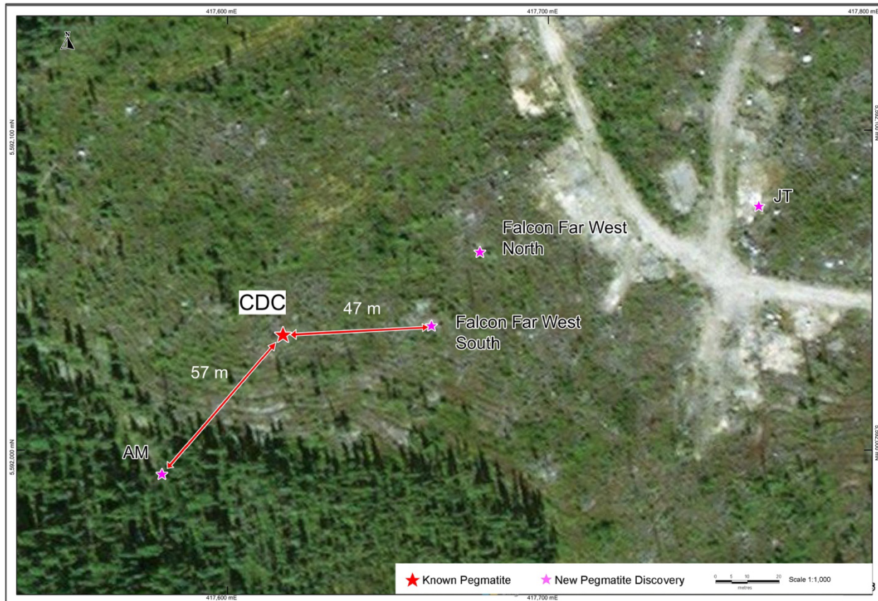
Figure 1. Newly discovered "CDC" spodumene-bearing pegmatite outcrop location in relation to known Lithium showings within the property (extensions are open for expansion).

The Company's technical advisor, Dr. Fred Breaks, commented, "This newest discovery adds to an expanding spodumene pegmatite inventory within the Falcon West Lithium Property. We are optimistic that further exploration will continue to produce more spodumene pegmatite discoveries."